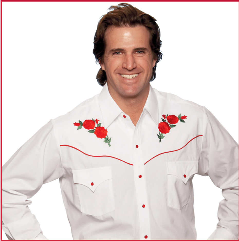
STYLE: 01-RM-009-684-WH DESCRIPTION: Ely Cattleman Men's Long Sleeve White Shirt with Rose Embroidery. FABRIC: Cotton / Polyester Blend SIZES: S-2XL