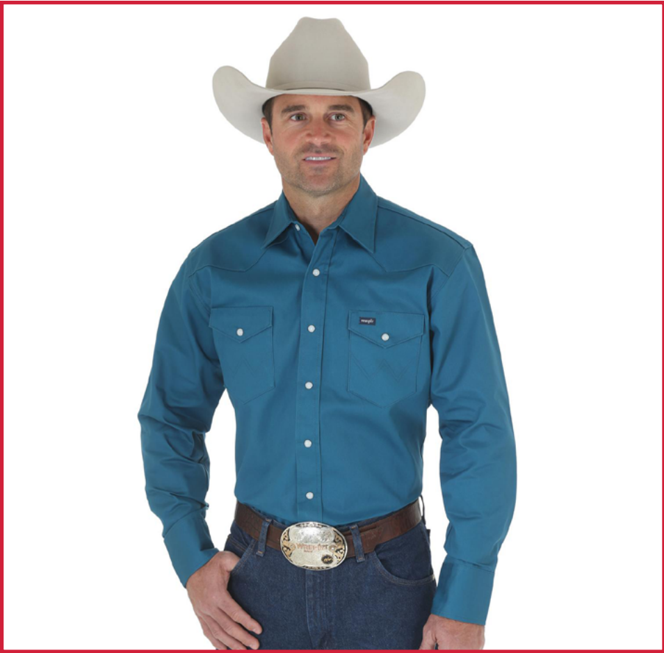
STYLE: 01-RM-009-777-BU DESCRIPTION: Wrangler Western Men’s, Performance Snap Long Sleeves Long Sleeve Solid Shirt. FIT: Classic FABRIC: 100% Cotton SIZES: S-2XL BIG & TALL SIZES: MT-2XLT