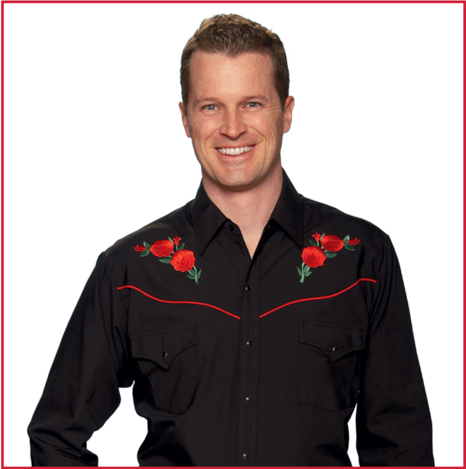
STYLE: 01-RM-009-685-BK DESCRIPTION: Ely Cattleman Men's Long Sleeve Black Shirt with Rose Embroidery. FABRIC: Cotton / Polyester Blend SIZES: S-2XL