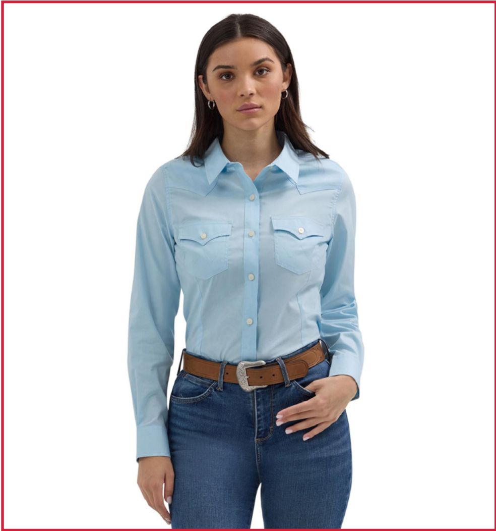
STYLE: 01-RW-009-699-BU DESCRIPTION: Women’s Wrangler Retro® Western Button-Down Shirt. Western yokes, a pointed collar, and a full button closure. FIT: Classic FABRIC: 97% Cotton / 3% Spandex SIZES: XS-3XL