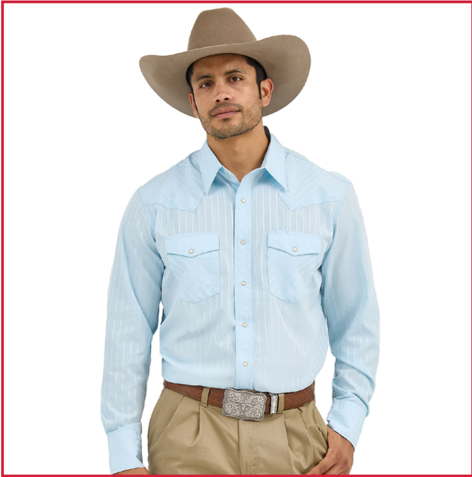
STYLE: 01-RM-009-561-BU DESCRIPTION: Wrangler Sports Western Basics Dobby Print Men’s Shirt, western yokes, three snap cuffs, snap, tone on tone dobby stripe classic fit. FIT: Classic FABRIC: 80% Polyester / 20% Cotton SIZES: S-2XL BIG & TALL SIZES: LT-2XLT