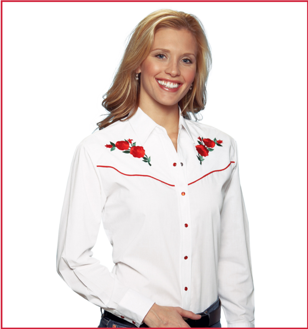
STYLE: 01-RW-009-686-WH DESCRIPTION: Ely Cattleman Women's Long Sleeve White Shirt with Rose Embroidery. FABRIC: Cotton / Polyester Blend SIZES: S-2XL