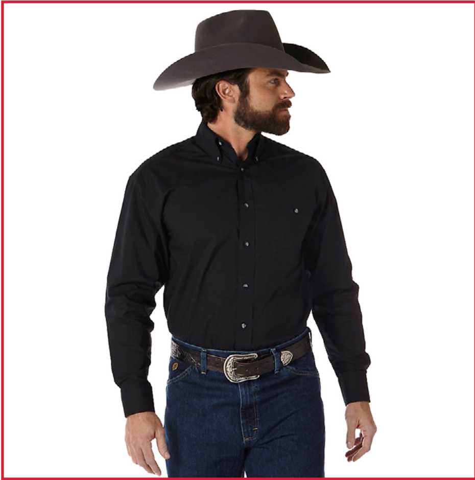
STYLE: 01-RM-009-511-BK DESCRIPTION: Wrangler George Strait Men's Shirt, single pocket, button down collar, button closure. FIT: Relaxed FABRIC: 85% Cotton / 15% Polyester Poplin SIZES: S-2XL BIG & TALL SIZES: MT-2XLT