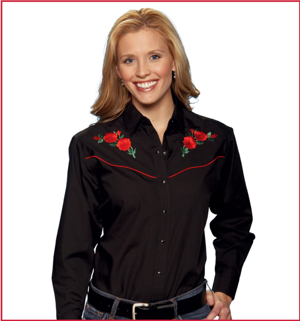
STYLE: 01-RW-009-687-BK DESCRIPTION: Ely Cattleman Women's Long Sleeve Black Shirt with Rose Embroidery. FABRIC: Cotton / Polyester Blend SIZES: S-2XL