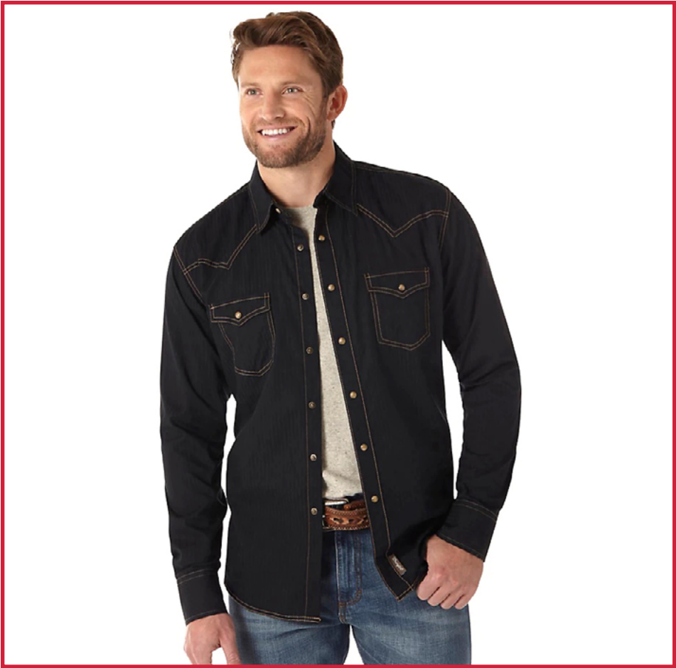
STYLE: 01-RM-009-521-BK DESCRIPTION: Wrangler Retro Black Men's Shirt with off set pockets, slim fit, Vintage Yokes with Decorative Stitching, Contrast Trim, Heavy Stitching. FIT: Slim FABRIC: 100% Cotton SIZES: S-2XL BIG & TALL SIZES: LT-3XLT