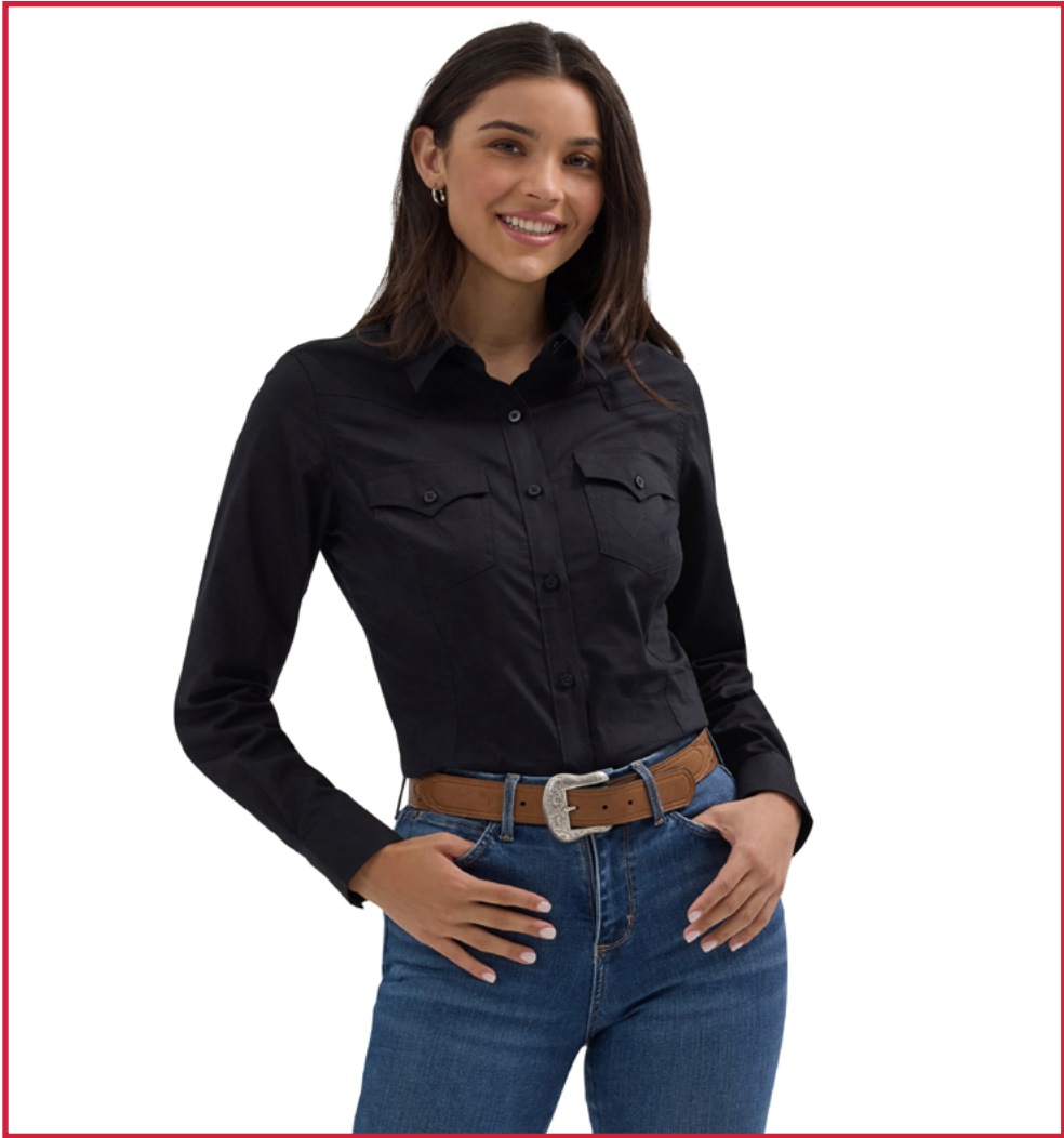
STYLE: 01-RW-009-633-BK DESCRIPTION: Women's Wrangler Retro® Western Button-Down Shirt. Western yokes, a pointed collar, and a full button closure. FIT: Classic FABRIC: 97% Cotton / 3% Spandex SIZES: XS-3XL