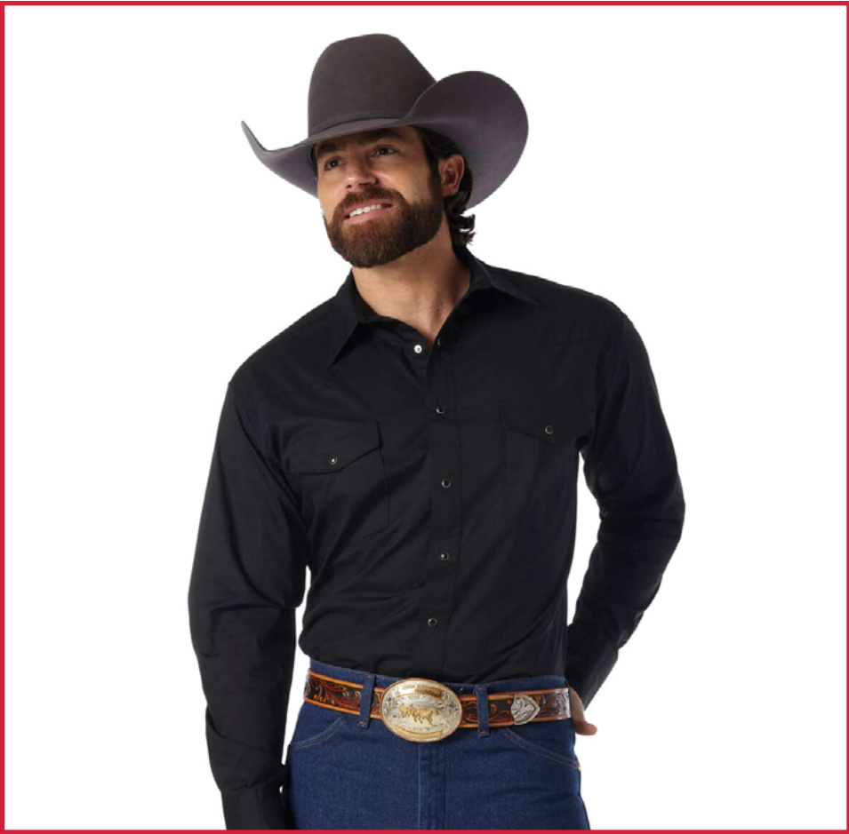
STYLE: 01-RM-009-551-BK DESCRIPTION: Wrangler Men's Classic Fit Long Sleeve Solid Snap Shirt. FABRIC: 55% Cotton / 45% Polyester, 4 oz. Solid Broadcloth SIZES: S-2XL BIG & TALL SIZES: 3X, LT-2XT